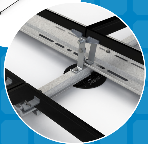
Clamps Wrap Module Frame

LISTED UL2703 BONDING & GROUNDING MECHANICAL LOADING SYSTEM FIRE CLASSIFICATION